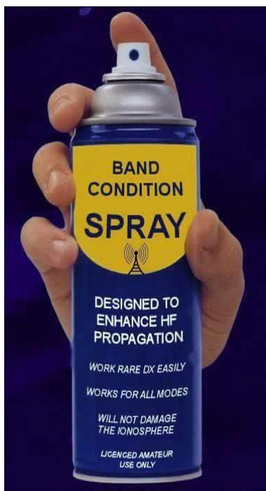
SURE NEEDED THIS DURING THE LAST MONTH'S SUN ACTIVITY