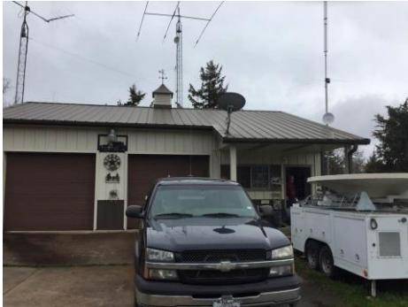
Mike's Ham Shack